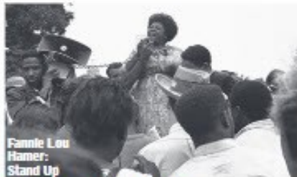
Fannie Lou Hamer: Stand Up