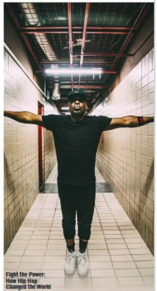
Fight the Power: How Hip Hop Changed the World

From successful artists to changing history, follow the global evolution of Hip Hop.