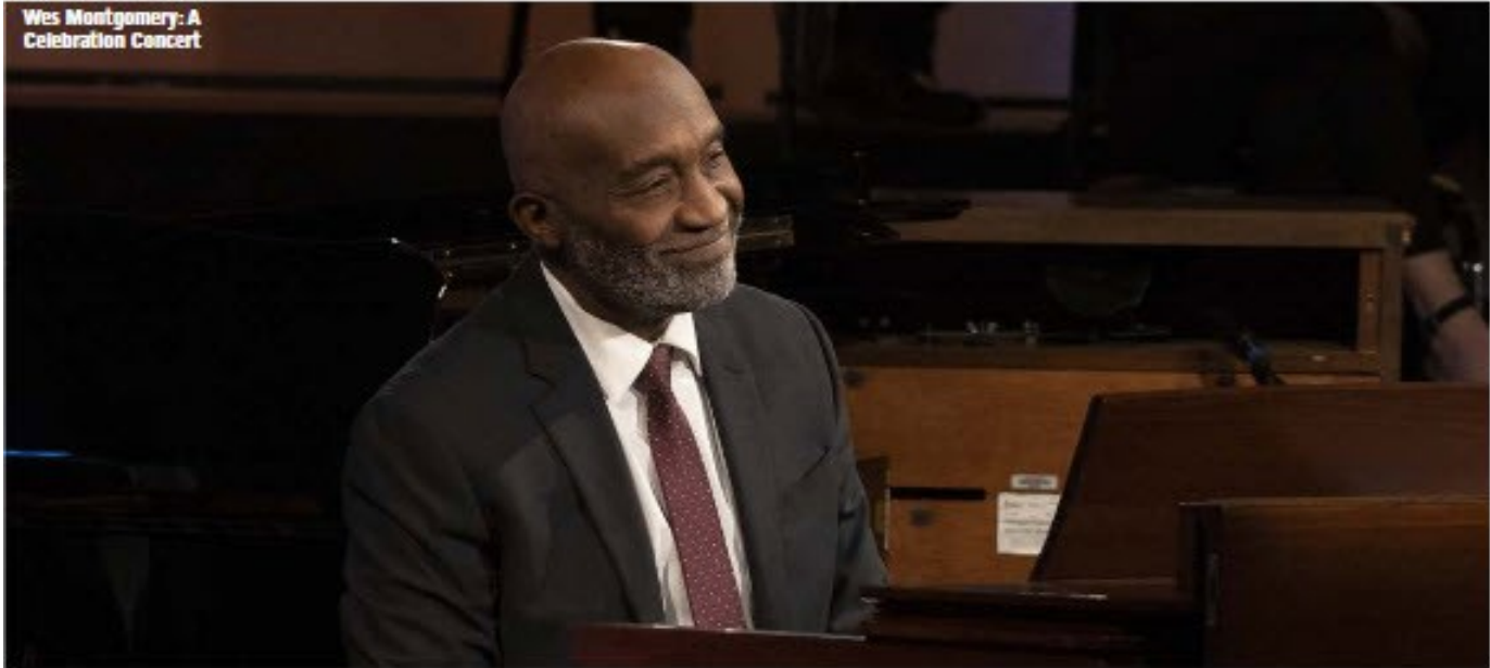
Wes Montgomery: A Celebration Concert