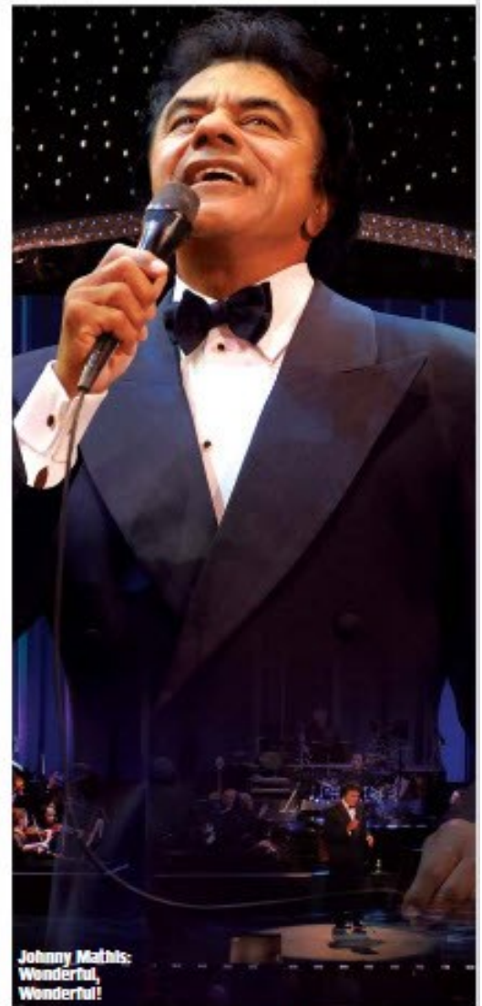
Johnny Mathis: Wonderful, Wonderful!

Recorded on his 1994-1995 world tour, this concert features the legendary Luther Vandross at his most smooth and sensuous.