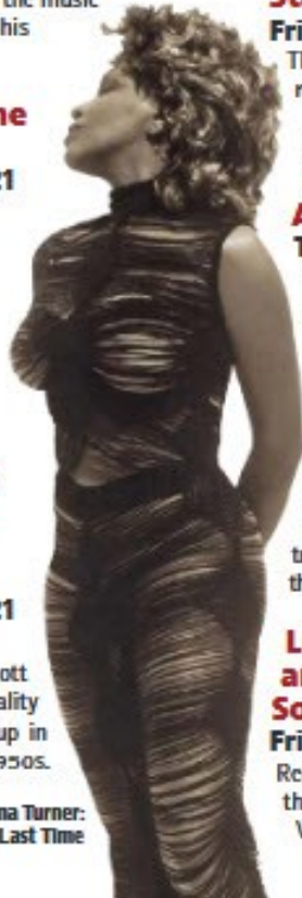
Tina Turner: One Last Time

Jazz virtuoso Hazel Scott champions racial equality before getting caught up in the Red Scare of the 1950s.